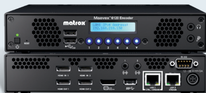
Matrox Maevox 6120 dual 4K encoder appliance (front & back view)

The Maevox 6100 Series is available as system-independent, standalone encoder appliances (Maevox 6150 quad and 6120 dual), as well as a single-slot, high-density PCIe x8 quad encoder card (Maevox 6100).