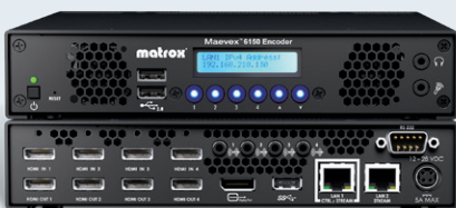
Matrox Maevox 6150 quad 4K encoder appliance (front & back view)