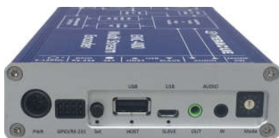
ENC-400 rear view